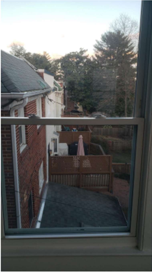
View East from 2 nd floor showing additional homes on this block for scale and context